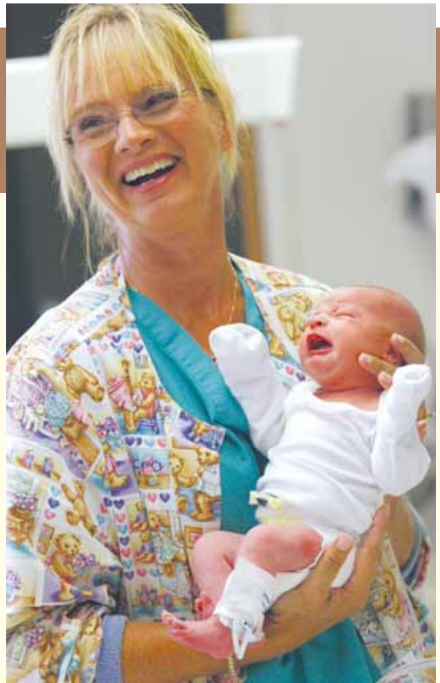
A newborn is welcomed into the world at Mercy Memorial Hospital System.

Healthy Monroe creates a community-based health plan by bringing together local healthcare providers in the Healthy Monroe network with the powerful advantages of Starmark, a distinguished leader in small group healthcare benefits. Healthy Monroe is available to businesses with two or more employees that select the Starmark Signature Advantage or Starmark Consumer Health Advantage plans, which can be customized to meet employer needs and specific budgets.